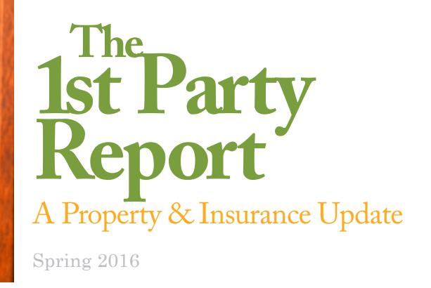
Timeless Values. Progressive Solutions